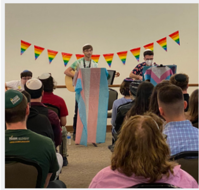
Diversity and Inclusion