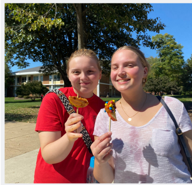
Jewish Holiday Celebrations