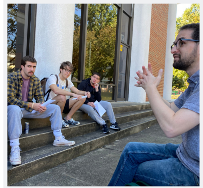
Jewish Learning Experiences