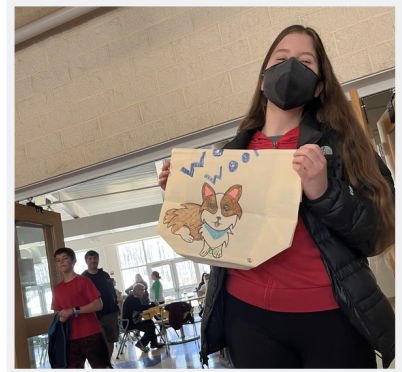
Community Outreach Initiatives (Interfaith, Political, & Social Justice)